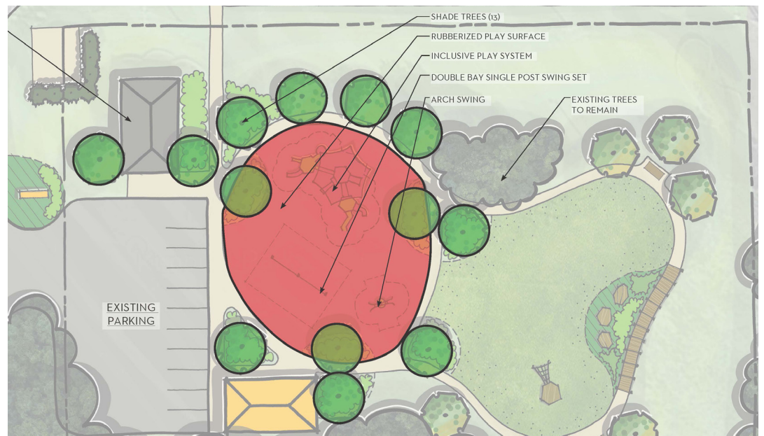
Kimbrel Park Improvement Map

post swing set, an inclusive play tower, and rubberized play surfaces with concrete curbing. The play equipment was specifically chosen to offer safe, inclusive activities and independent play for all users.